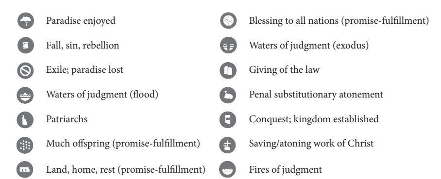
Fig. 2.3. God's KINGDOM Program through Images