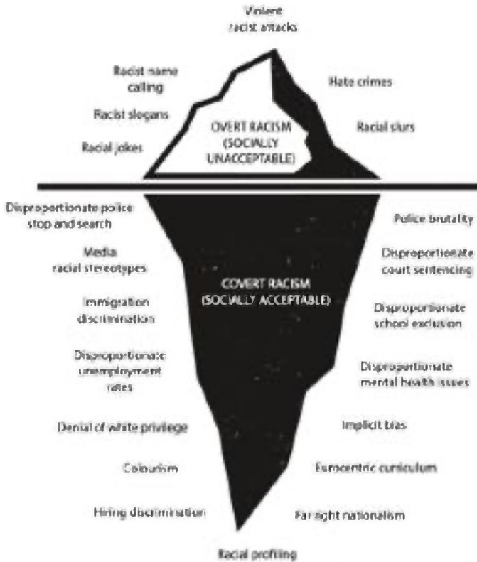
Figure 1 White supremacy iceberg

theory, and so much more. 71 That is why a figure like this “White supremacy iceberg” is unhelpful: 72